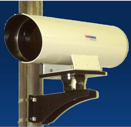
Picture shown with Optional Mounting Bracket

With its state-of-the-art 320x240 uncooled microbolometer detector and pressurized enclosure, the TR3000 Series of Uncooled Thermal Infrared Night Vision camera is the ultimate night vision security product. TR3000 is designed for long-range surveillance in total darkness and extreme conditions. Model TR3000N is an improved version of Cantronic's Model TR3000 basic camera—offering an improved NETD spec and smaller detector pitch.